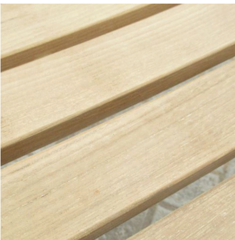
NATURAL TEAK FRESH