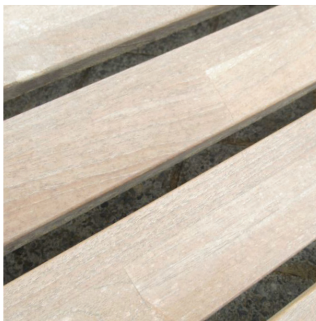
NATURAL TEAK 3-6 MONTHS