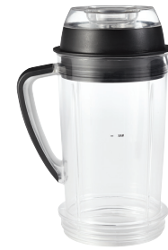
1 SouperBlast Pitcher with 2-piece Lid