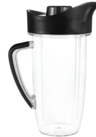
1 Oversized Cup with 1 Pitcher Lid