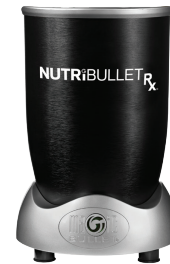
1 High-torque Power Base