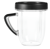
1 Short Cup with 1 Comfort Lip Ring