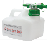
Jerry Can (Ethanol only)