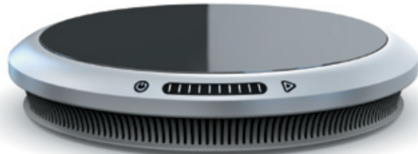
INDUCTION BURNER - 41000