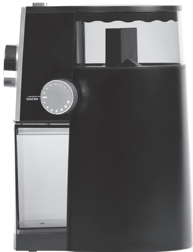
Proper placement of removeable parts